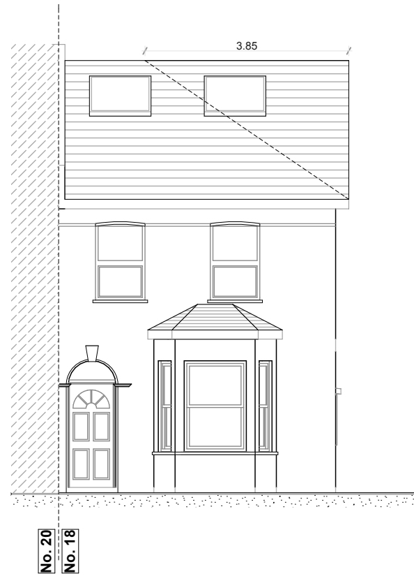
FRONT ELEVATION PROPOSED 1:100